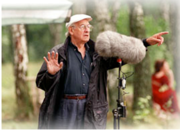
Director Andrzej Wajda in between questions on set.