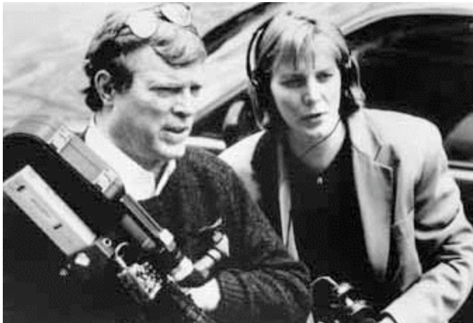
DA Pennebaker and Chris Hegedus