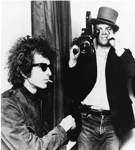
Shooting Bob Dylan's 1965 tour of England for "Don't Look Back"

Documentary filmmaker, DA Pennebaker will give the keynote address at Cityvisions 2006, the eighth annual showcase and festival of thesis films from the MFA in Media Arts Production at City College. This year's event, featuring twelve new documentaries and fiction shorts will take place at the Clearview 62 nd & Broadway Cinema on May 30 th and 31 st , starting at 6PM. DA Pennebaker is widely regarded as one of the pioneers of cinema verite filmmaking. The style revolutionized the documentary